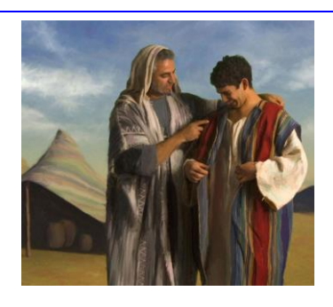
Tues AM Bible Study: Genesis Part II Jacob and Joseph: Like Father, Like Son